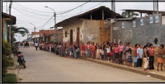
Lines form to see a medical mission team visiting in Peru. Some people waited overnight to see a doctor and get help.

We started the month of June with a mission team from Lewis Memorial UMC. This team of eleven helped with the start of the construction of a classroom building for the Casa de Oración Quechua Church in Chilca. The team helped to construct the foundations for the building, cutting and placing steel reinforcing bars, and pouring concrete. They also helped to start a new Kid's Club in Chilca. By the end of the week there were over 400 children coming to the event. The team participated in services in the church throughout the week encouraging the members of the congregation and sharing the gospel with visitors. Please be in prayer for this new Kid's Club and the young adults from the church that will continue to minister there on a weekly basis.