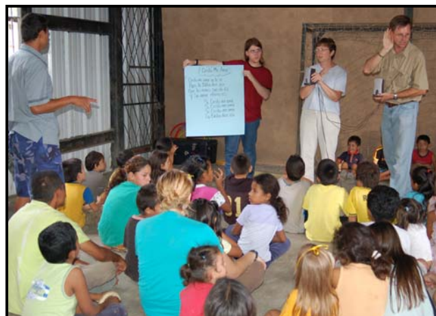
Leading bible songs during ministry with the children at La Carpio.