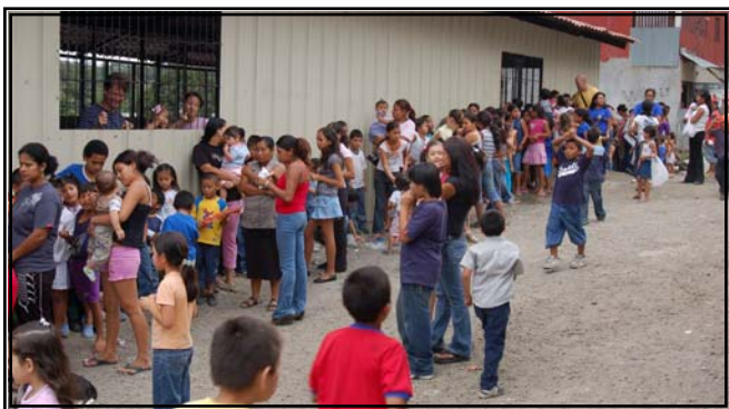
Children lined up for the La Carpio Christmas Party.

Also, special thanks to our supporters – this is one of the ways in which your support money is being used. You helped to provide gift bags for 200+ children in the La Carpio community. You partnered with missionaries from other organizations who also provided goodies for the gift bags.