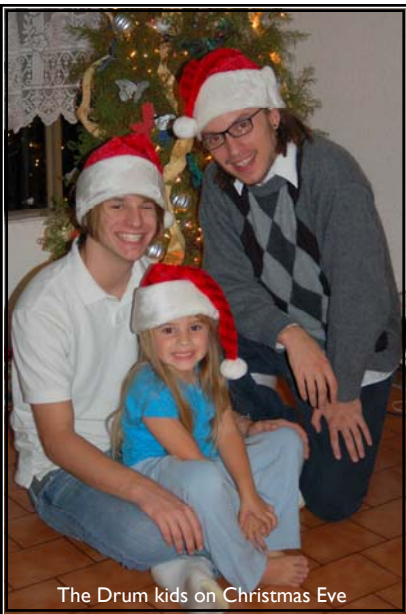
The Drum kids on Christmas Eve