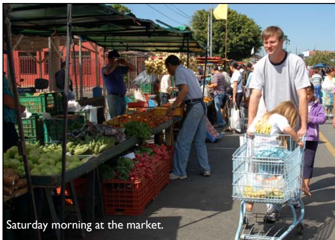
Saturday morning at the market.

TAX DEDUCTIBLE GIFTS MAY BE SENT TO: The Mission Society PO Box 922637 Norcross, GA 30010-2637 USA DESIGNATE GIFTS: "DRUM SUPPORT 5/321"