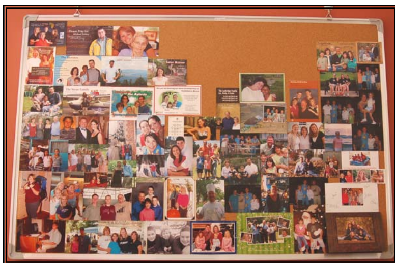
Our supporter bulletin board in our home office... we pray for you and remember your face daily. Please send in your photo so you can be included!

TAX DEDUCTIBLE GIFTS MAY BE SENT TO: The Mission Society PO Box 922637 Norcross, GA 30010-2637 USA DESIGNATE GIFTS: "DRUM SUPPORT 5/321"