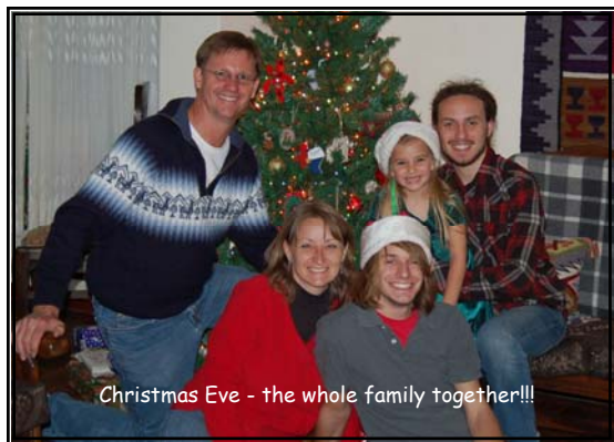
Christmas Eve - the whole family together!!!