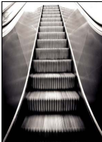
Striking fear in the hearts of thousands...

The most fun part of the "mall" is watching the people try to get on and off of the escalator. Yes, there is an escalator (the movie theatre and clothes store are upstairs). Our new "ministry" seems to be helping people get over their fear of the mechanical stairs and holding hands with Quechua women who are terrified to ride up to the second floor. We have watched several escalator accidents as people tried to get on, then chickened out and lost their balance as their hand kept going up and their body tried to go backward!