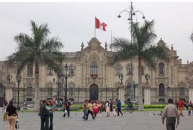
Presidential Palace of Peru (Lima)