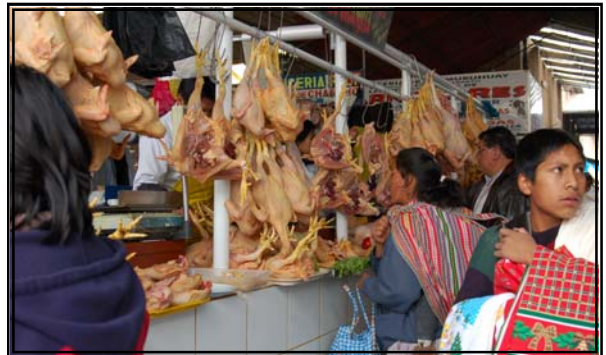
Chicken and turkey hanging in the meat market in Peru.

Sometimes I consider health issues... when I ruptured the disc in my back last year and was in immense pain, Billy had me in the emergency room within 20 minutes. Within the hour, a doctor