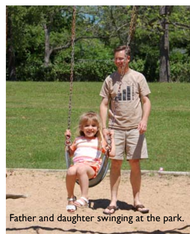
Father and daughter swinging at the park.